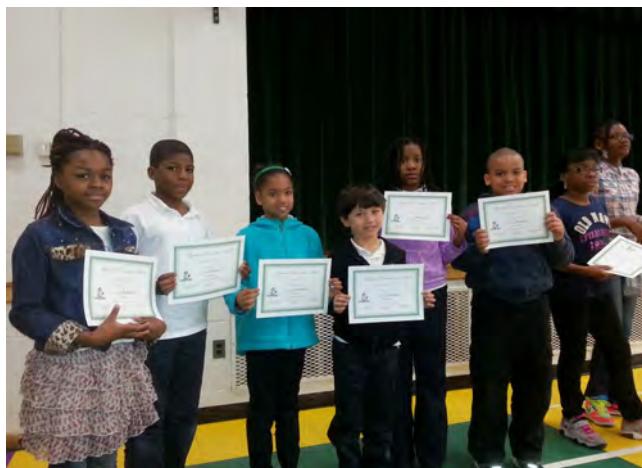
Third Grade IB winners for Balanced